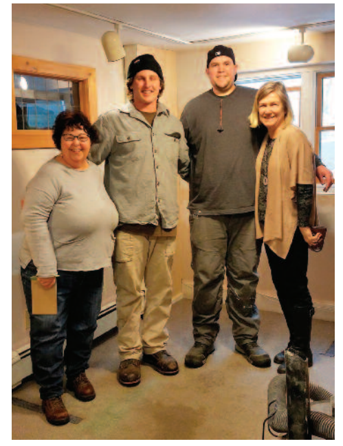
Thanks to our generous friends at W. Herbert Goodick Inc, for their help building our new Awesome Closet at Wellspring!

to our corporate partners, as well as individuals who donated clothing. The "Awesome Closet" is now open and available to all program participants—men and women—in need of casual/business attire.