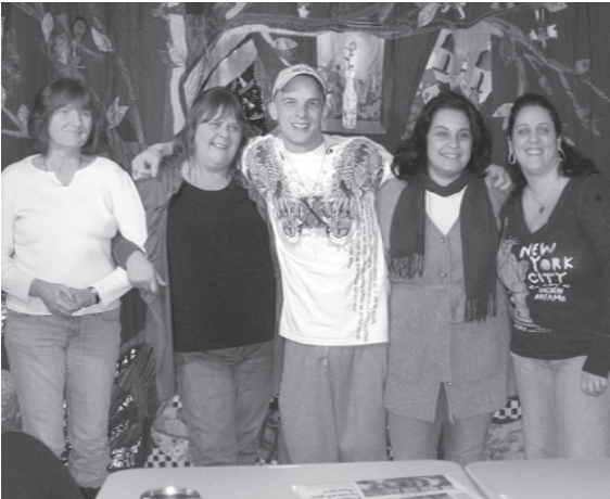
Gathered together are some of the members of Wellspring’s Adult Learning Initiative Class of February 2011.