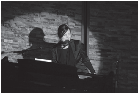
Paula Cole on the piano.