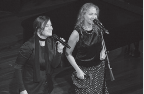
Paula Cole and Joan Osborne perform together.