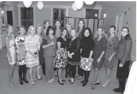
2012 Benefit Concert Committee