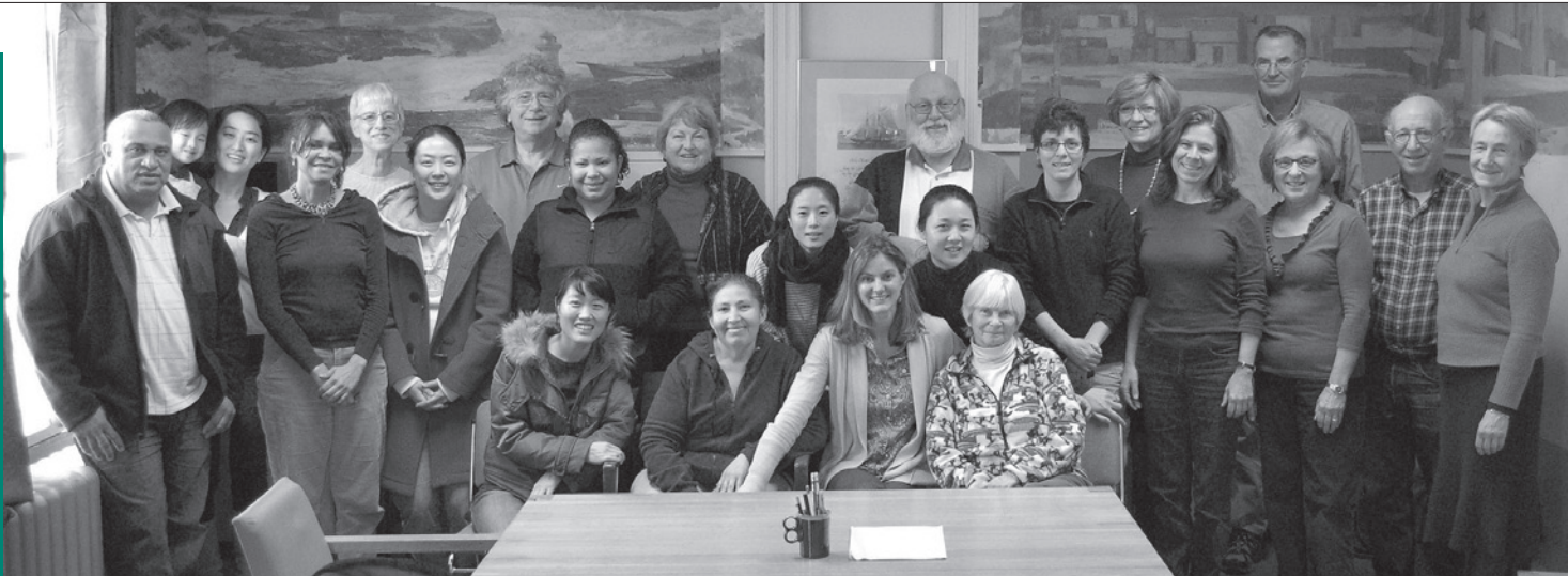
Wellspring's English Language students and their tutors.