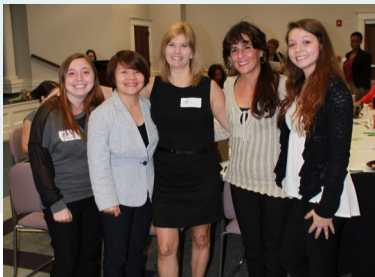
Mediclerk Reunion, Spring 2016

Tuition assistance may be available. For more information, please call 978-354-2495.