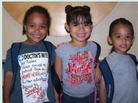
Happy children model their new backpacks from the generous employees of Bingham McCutchen LLP and Appleseed's.

Our friends at Bingham McCutchen LLP and Appleseed's answered the call this year. Employees took names and shopped for school supplies and that most essential carryall and canvas of self-expression accessory – the backpack. They delivered 72 personalized, extraordinary backpacks that caused kids and