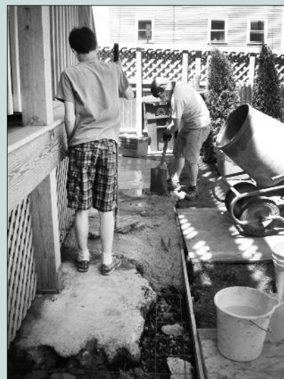
Prepping for the playspace.