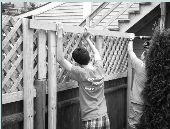
Top trim is added to the privacy fence.