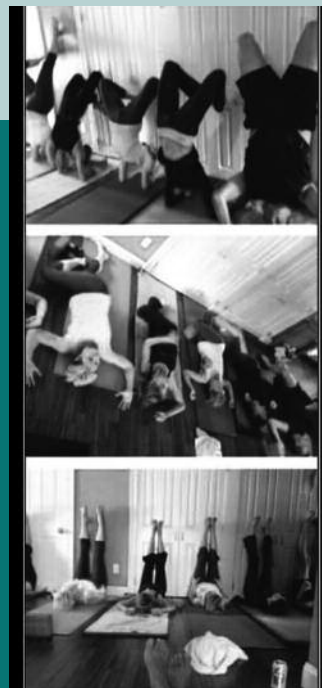
The ladies of the ZenDen in action.

If you are interested in pursuing an initiative on behalf of Wellspring House please contact Romy Gardner at 978-281-3558 ext. 302