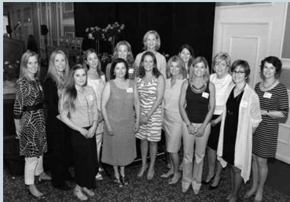
2012 Luncheon Committee