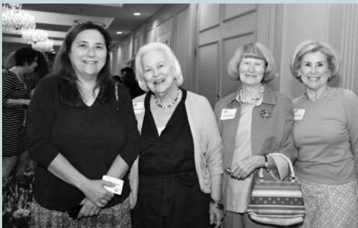
Guests pose for a photo